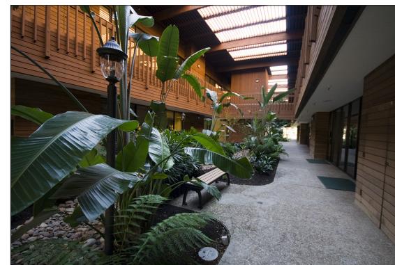
Lush landscaping adds to the unique garden environment.

The information contained herein is based on reliable data, measurements and calculations. We have no reason to doubt its accuracy, but we do not guarantee it. All information should be verified prior to purchase or lease.