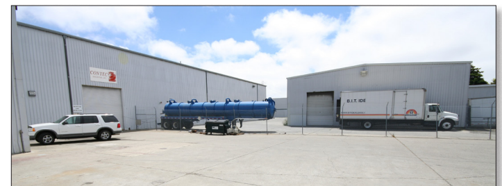
Catalina Street houses several industrial/flex buildings in the South of Marina Business District (SOMAR).